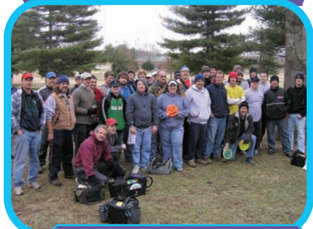
BOWLING GREEN, KY