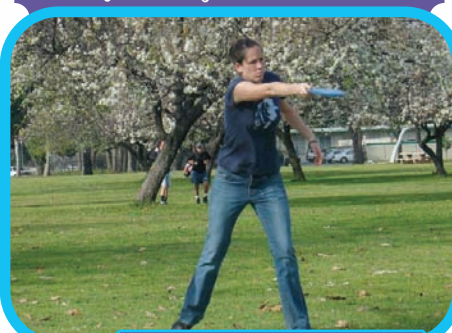
LOS ANGELES, CA