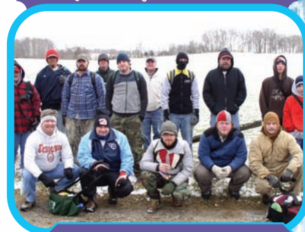
GREEN COUNTY, TN