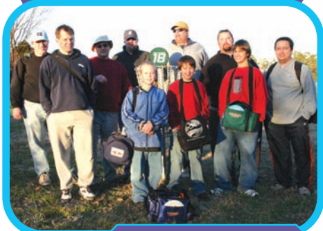
APRIL 2006, ME