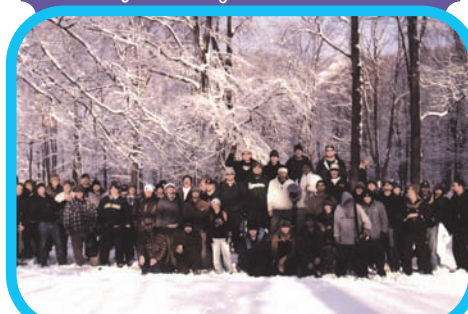
GRAND RAPIDS, MI