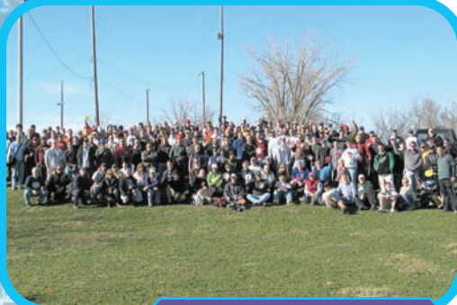
KANSAS CITY, MO