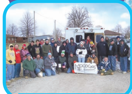
UPPER SANDUSKY, OH