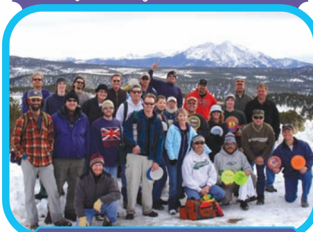
GEORGETOWN SPRINGS, CO